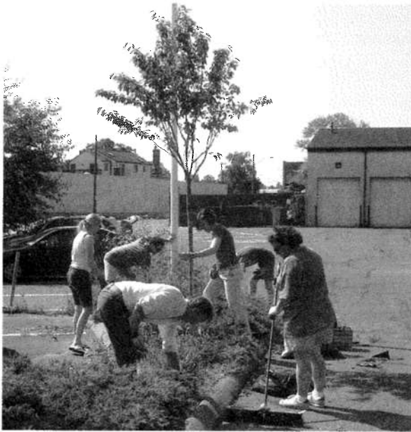
That looks better! GNA volunteers met at the train station parking lot on a recent Saturday morning to weed the Liberty Garden.