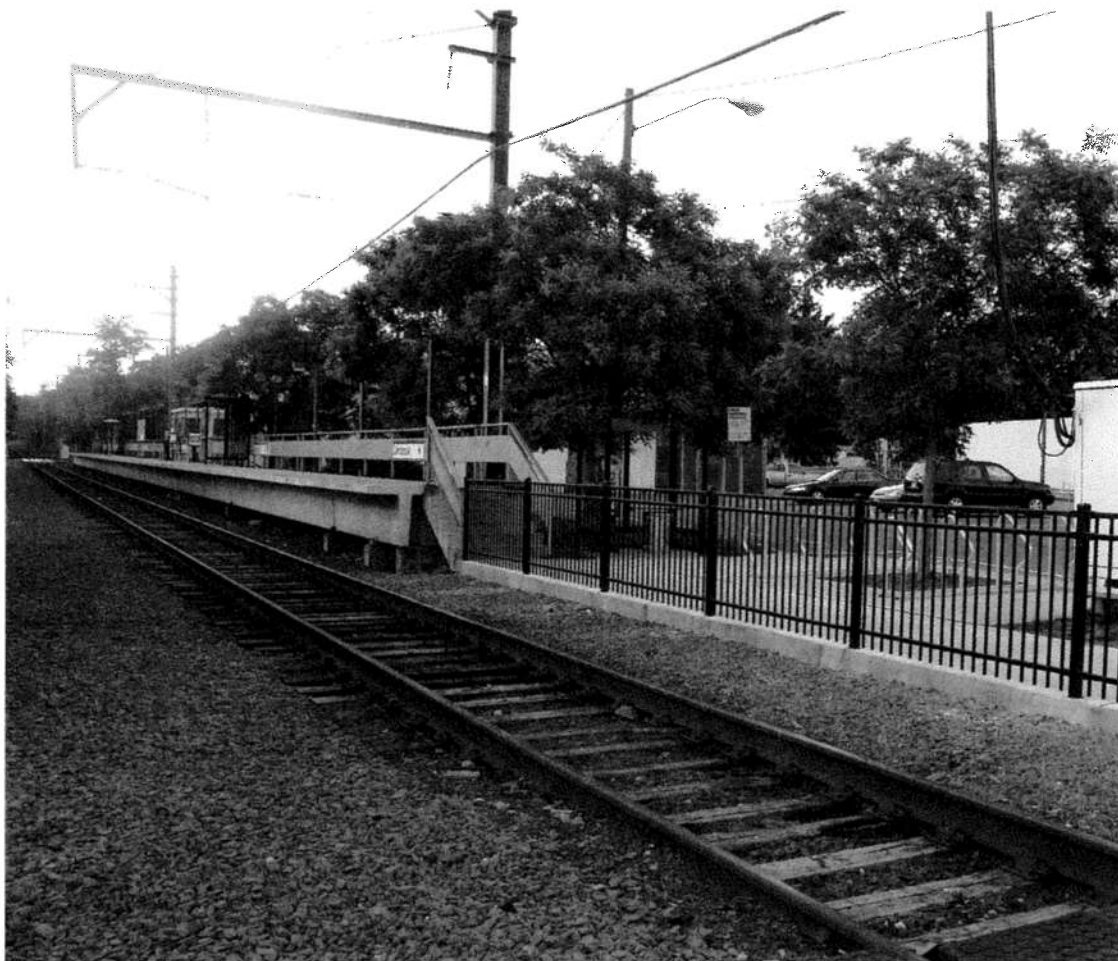
GNA worked with the City's transportation planner and engineering department to determine the scope of the grant-funded improvements to the Glenbrook train station.