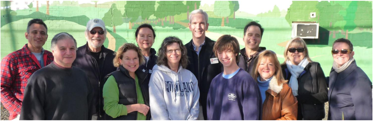
GNA volunteers at the Annual Neighborhood Clean Up and Swap, October 2010