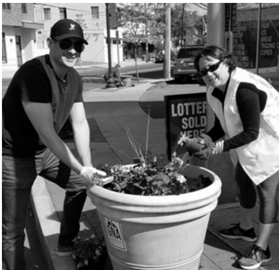
A lot gets done at our Spring and Fall Cleanups. Volunteers prepare sidewalk planters, weed train station gardens, collect litter, run a free tag sale, and make a dumpster and shredder available to the public.

The new maintenance worker at the train station does a great job!