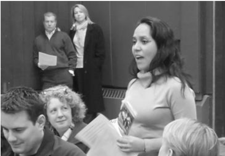
A new business member introduces herself at a GNA meeting

Friendliness is a hallmark of GNA meetings. We make room in the agenda for new members, visitors, and first-timers to introduce themselves.